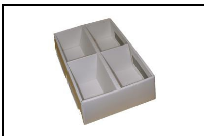
Divided in 4 compartments