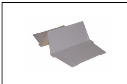
Separation wall 1/2