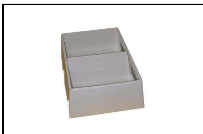
Divided in 2 compartments